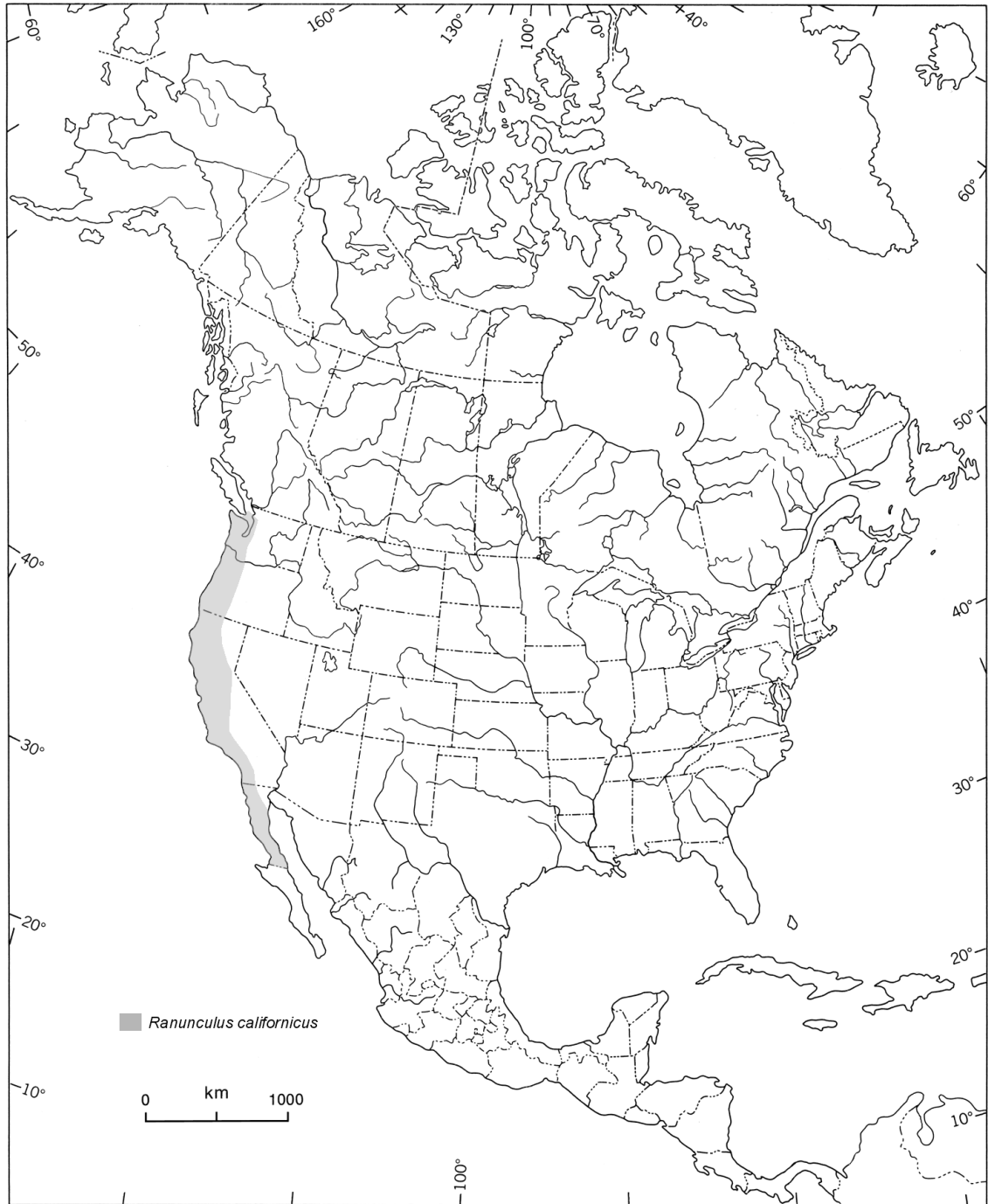
Figure 1: Distribution of Ranunculus californicus in North America (the eastern and southern boundaries of the distribution are approximate and subject to revision). (Sources: Hickman 1993, NatureServe Explorer 2002, BCCDC 2003).