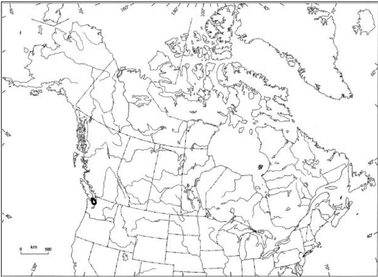
Figure 3. Canadian Range of Orthocarpus bracteosus

Orthocarpus bracteosus has been known in the Victoria area since 1893. Historical records for Sidney, Oak Bay, Victoria and the Patricia Bay Highway are unmappable because the locality is too vague. Historical records of populations at Rollin's Farm, Blenkinsop (Lost) Lake, Mount Douglas (Cedar Hill) and Beacon Hill are at least 90 years old and no populations have been reported in recent years. They have probably been extirpated. The Elk Lake collection from 1933 may be from the same population as the 1954 collection from the Patricia Bay Highway but it has not been found recently despite detailed searches of the most suitable habitats by the senior author in 2000 and 2001. These searches also covered: