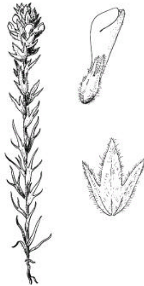
Figure 1: Illustration of Orthocarpus bracteosus Benth. from Douglas et al. (2000)

In the field, rosy owl-clover may be confused with several annuals within the Castillejinae that potentially co-occur with it including: paintbrush owl-clover ( Castilleja ambigua ), narrow-leaved owl-clover ( Castilleja attenuata ), dwarf owl-clover ( Triphysaria pusilla ) and bearded owl-clover ( Triphysaria versicolor ssp. versicolor ). Members of Triphysaria can be immediately separated when in flower because their anthers are 1-celled and their lower corolla lip is strongly three-pouched. In both Castilleja and Triphysaria the tips of the beak-like upper corolla lips are open and the stigma is expanded, while Orthocarpus has closed tips and a dot-like stigma. Castilleja ambigua , C. attenuata , and Triphysaria versicolor spp. versicolor have white or yellow corollas (sometimes with purple markings and/or fading pinkish) in contrast to the rose-purple corollas typical of O. bracteosus . The red-purple corollas (4-6 mm) of Triphysaria pusilla are much smaller than corollas of O. bracteosus (12-20 mm) (Douglas et al. 2000).