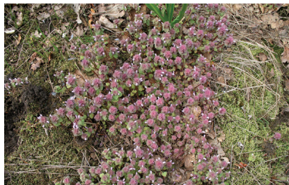
Purple Dead-nettle growing among native mosses in a thin-soil, rocky site.

Purple Dead-nettle is an annual or facultative biennial (delaying reproduction to second year due to environmental conditions) member